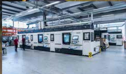
AUTOMOTIVE MANUFACTURING Facilitating Growth